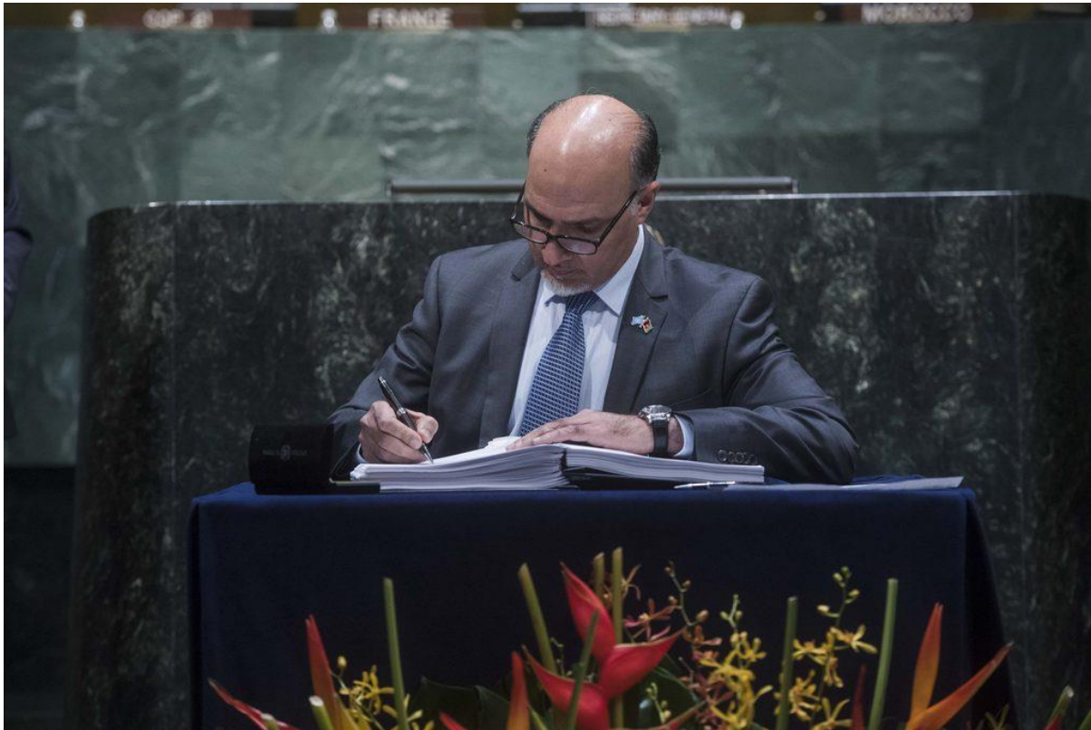
Figure 1. Mr. Mahmoud Saikal (Ambassador extraordinary and plenipotentiary permanent representative of the Islamic Republic of Afghanistan at the UN) signed the Paris Agreement on climate changes [8].

efforts to limit the temperature increase even further to 1.5 degrees Celsius."